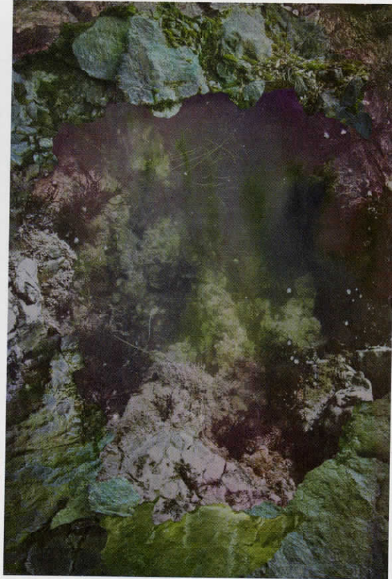
Archival-pigment prints, collage on panel, 60 x 43 in. (152.4 x 109.2 cm).